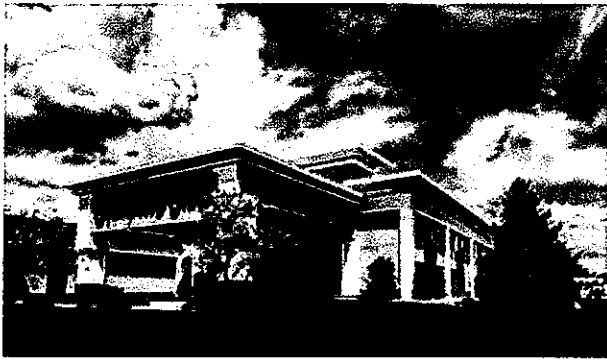
Hampton Inn Winchester